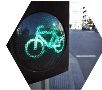
Safety Improvement Design

Crash Reporting Risk Assessment Policies and Guidelines Crash Analysis